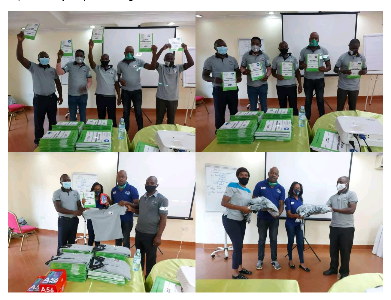
The Hunger Project/ Movement for Community Led Development delegation visit to Mengo Youth development Link

In preparation for the upcoming skilling program supported by Latek Stay Alliance Uganda, MYDEL received training materials, T-shirts, phones and materials for beneficiaries at Grand Global hotel. MYDEL was among the four organizations selected in Uganda by the donor to implement the vocational skills training program. This Vocational program is being currently implemented jointly with Rubaga Division KCCA.