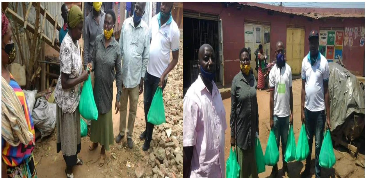
MYDEL Board members