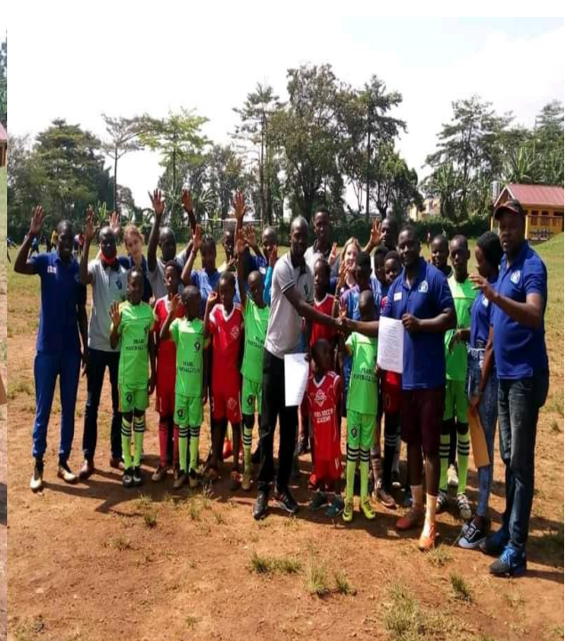
Mengo Youth Development Link and Pearl Football Club appearance in the New Vision Action more than just Sports.