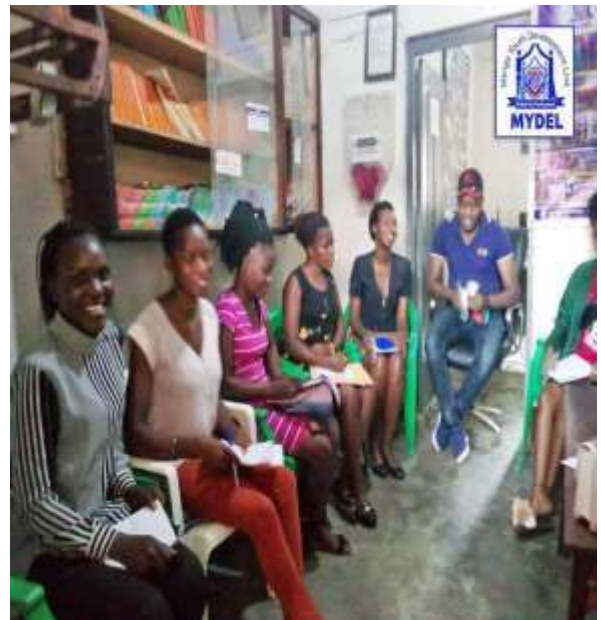
SPECIAL APPEARANCE IN THE NEWS PAPERS