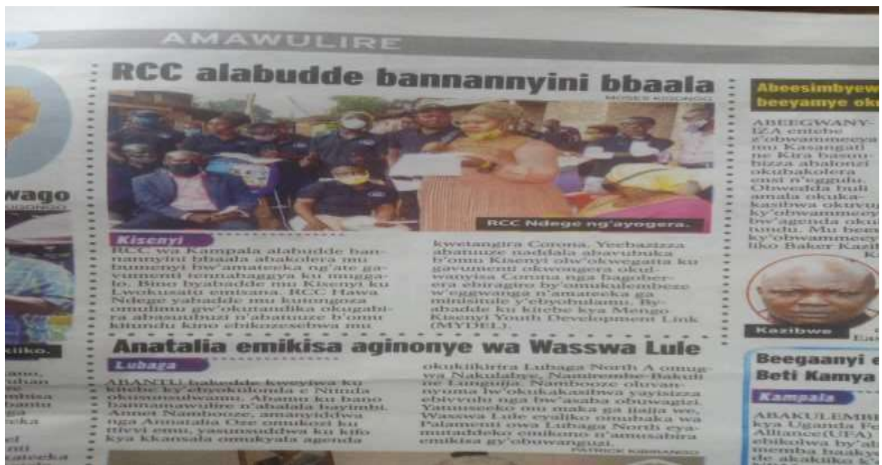
MYDEL in the new Buksedde News Papers