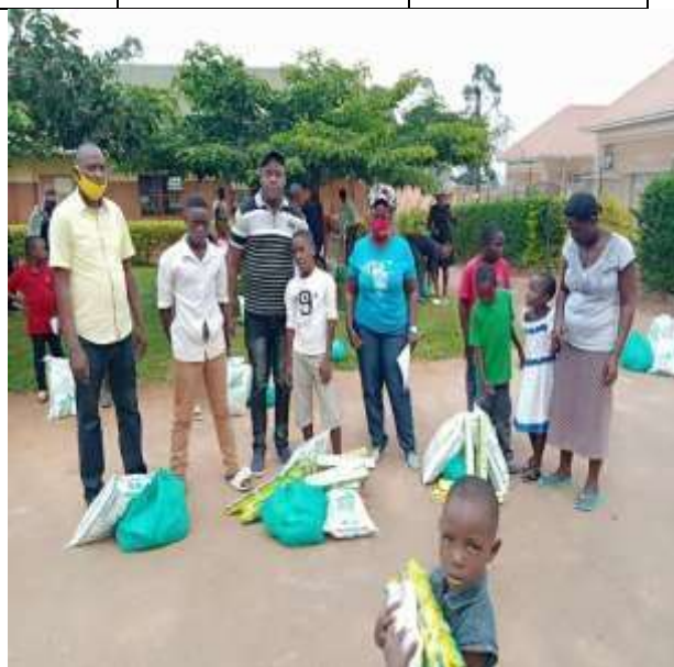
MYDEL Food Relief in Namungona supporting 176 children